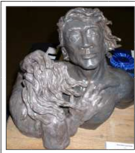
"Reconciliation," by Lynn Peverill, 3rd place, Semi-professional sculpture