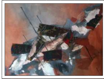
"Enigma No. 3," by JoNan Carr, Hon. Mention, Non-professional abstract/experimental winner at 2010 LSAG Convention Show

P.O. Box 3623 Conroe, Texas 77305 TEL: 936-448-1809