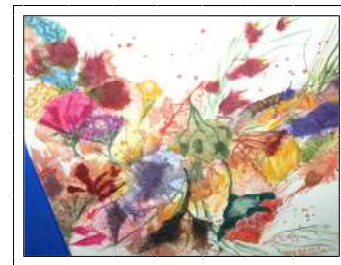
"Florists's Discards," by Ann Blackmer, 1st Place, Adult Student, abstract/experimental (courtesy photo)