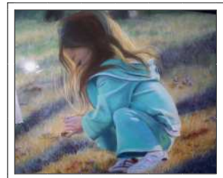
"Treasured," by Debi Sparks, 3rd place, Adult student, pastels