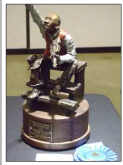
"Will the Circle be Unbroken," by Craig Campobella, 1st place, Professional sculpture