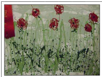
"Poppies," by Kerry Conkling, 2nd place, Adult student, abstract/experimental