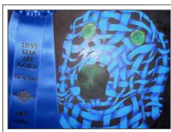
"My Blue Dog," by Emily Parrott, 1st place High School student, (colored pencil)