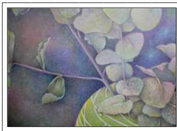
"Eucalyptus," by Golda Rader, Hon. Mention, Semi-professional pastel